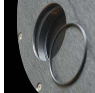
CFW-2-7 New threaded retaining ring system