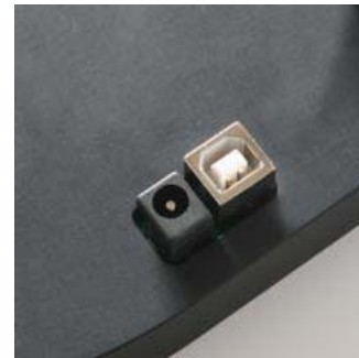
Direct USB connection